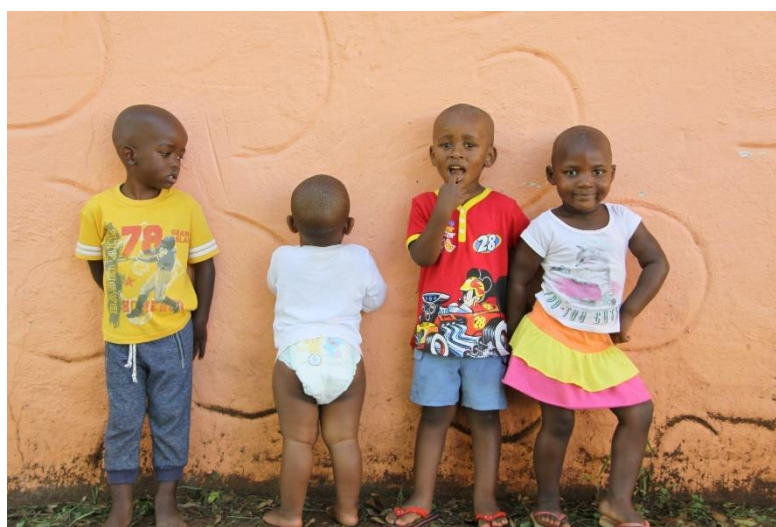
The three oldest children in this photo start "big school" next year